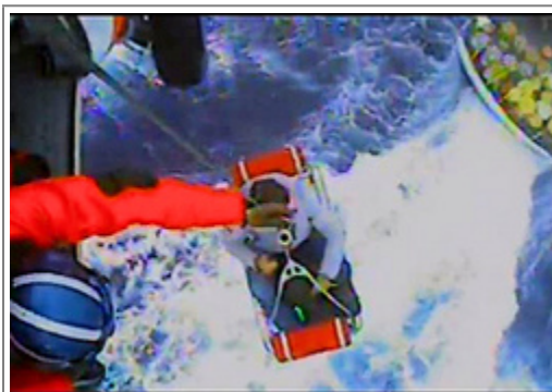
The ailing crewman is lifted from the deck of the USCG cutter Spencer into a MedEvac helicopter.