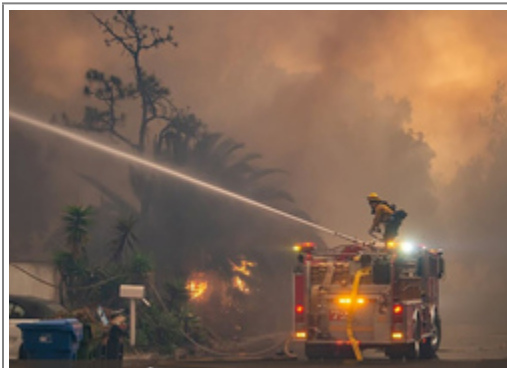
Firefighting efforts continue in residential neighborhoods.