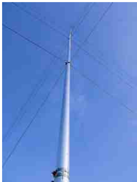
The 630-meter antenna at NO3M.